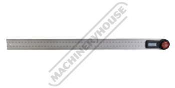
zero degree view