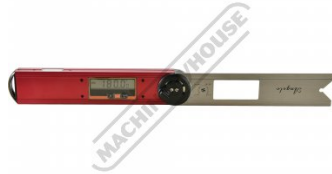
Shown at 180 Degree