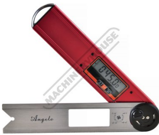
Negative 45 Degree