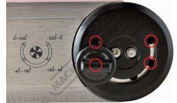
Blade Locking Positions