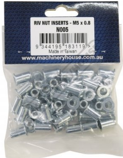
Packaging Rear Side