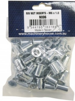
Packaging Rear Side