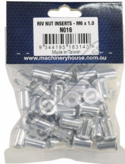
Packaging Rear Side