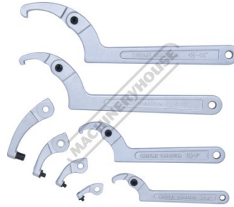
Set showing Sizes