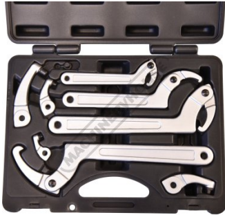
Shown in Case Top View