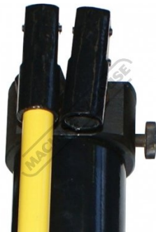
2 Stage Pump