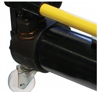
Portable on 3 Castor Wheels