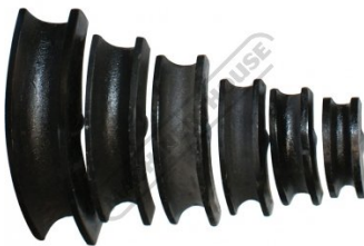
Includes 6 Formers