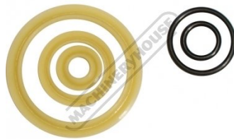
Includes Seal Kit