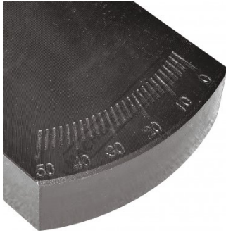
Adjustable Cutting Angle Up to 50 Degrees