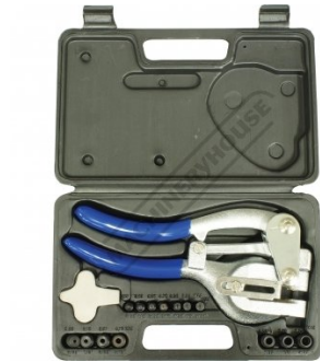
Shown in Case