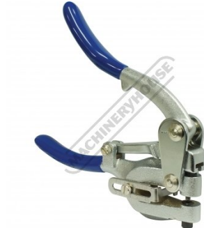
Hole Punch Tool