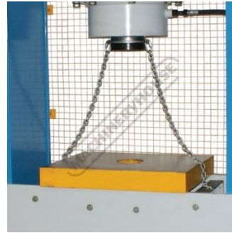
Table Height Adjustment