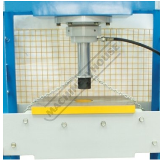
Table Height Adjustment