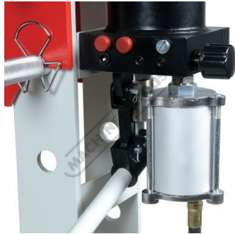
Hydraulic Pneumatic Hand Pump