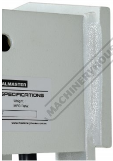
Robotic Welded Frame