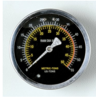
Metric / Imperial Pressure Gauge