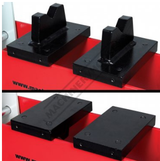
Dual Purpose Pressing Blocks