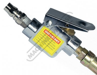
Pneumatic Valve Control