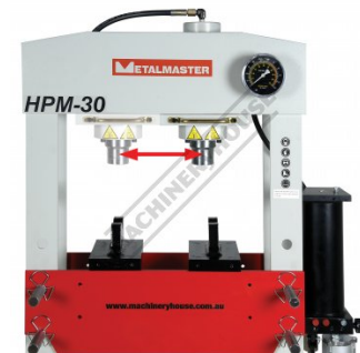
Horizontal Sliding Ram