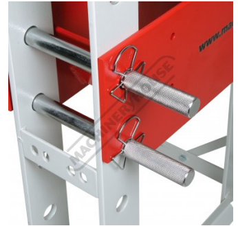
Table Pins With Safety Clips