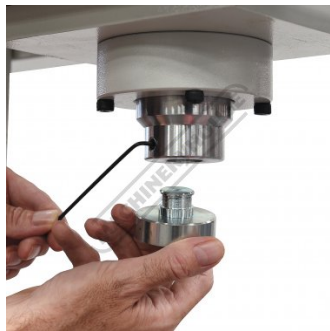
Includes Removable Ram Top Cap