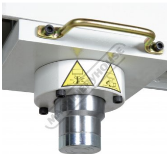
Sliding Ram With Handle