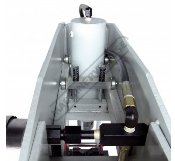
Ram Top View With Bearing Slide