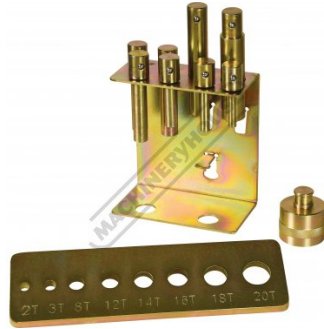
Pins Shown In Holder