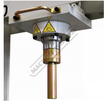
Pin Shown Attached To Adaptor