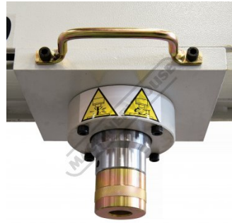
Adaptor Shown Attached To Ram