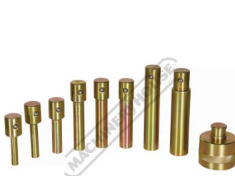
Pin Set & Adaptor