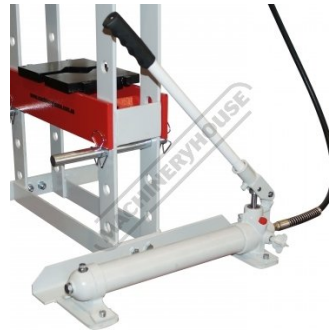
High Quality Hydraulics