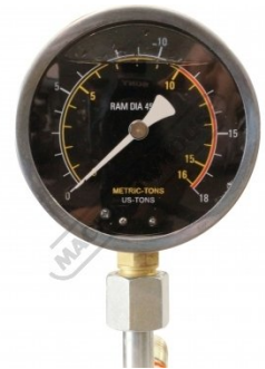
Metric / Imperial Pressure Gauge