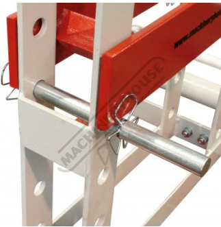
Table Pins With Safety Clips