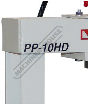
Robotic welded frame