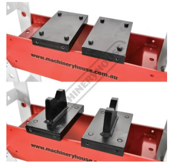
Dual Purpose Pressing Blocks