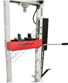
Hydraulic Hand Pump