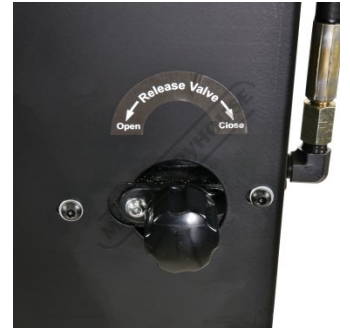
Hydraulic Pump Speed Control