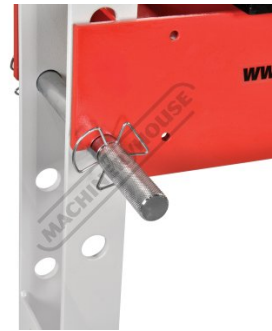
Table Pins with Safety Clip