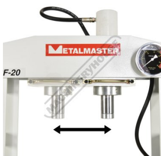
Horizontal Sliding Ram