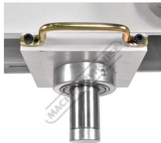
Ram & Handle