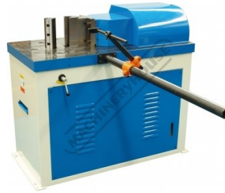
1000mm Manual Backgauge