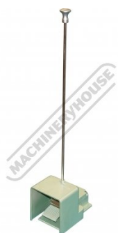
Roving Foot Pedal