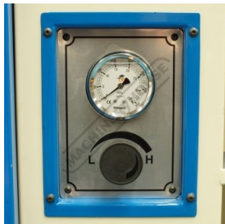
Pressure Adjustment Dial and Gauge