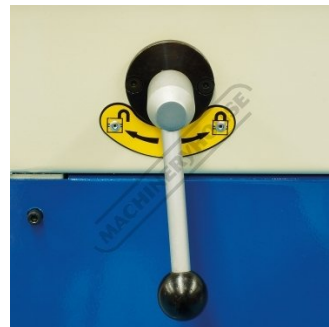
Main Post Release Lock Lever