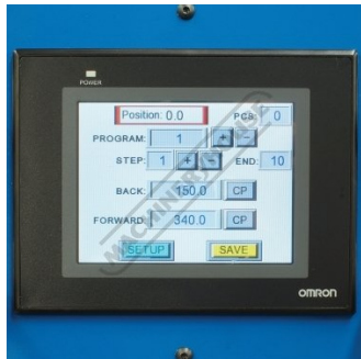
Touch Screen NC Control