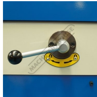
Main Post Release Lock Lever