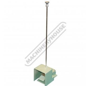
Roving Foot Pedal