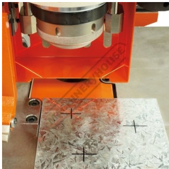
Laser Line On Galvanised Steel