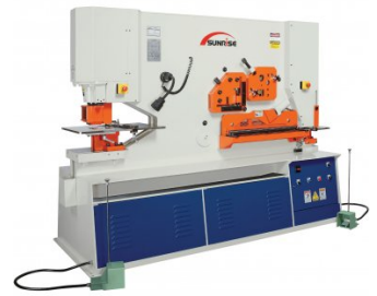
P178H Hydraulic Punch & Shear - 165 Tonne