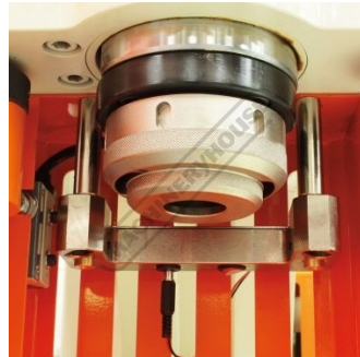
Fitted To Machine