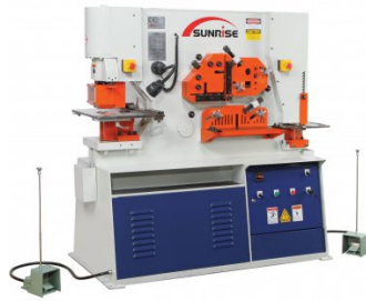
P177 Hydraulic Punch & Shear - 125 Tonne