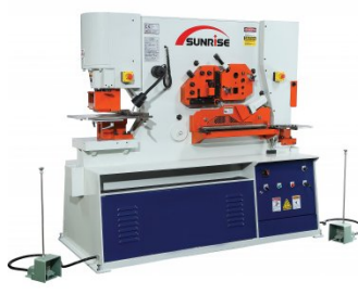
P177H Hydraulic Punch & Shear - 125 Tonne