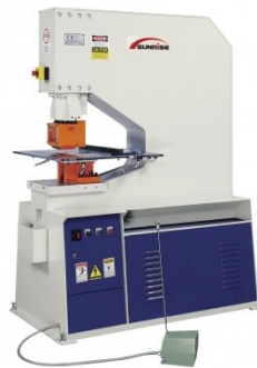
P194 Punching Machine