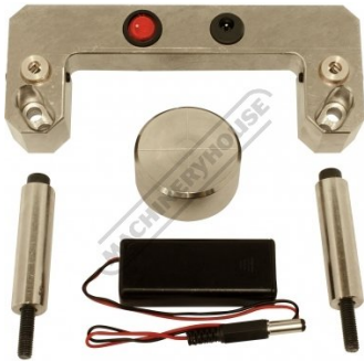
Laser Guide System