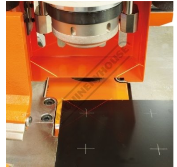
Laser Liner On Painted Steel