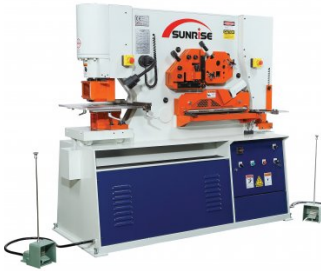
P176H Hydraulic Punch & Shear - 100 Tonne