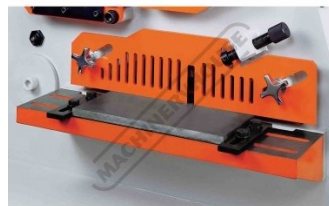
Flat Bar Shear