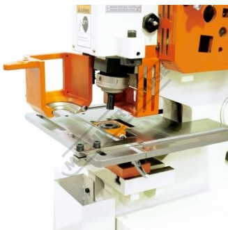
Work Table with Adj. Stops