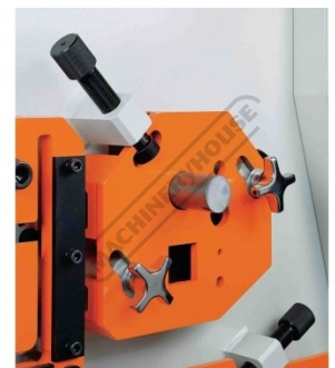
Round Bar Shear