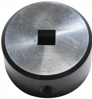
P6002 8.7 x 8.7mm Square Die