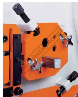
Square Bar Shear