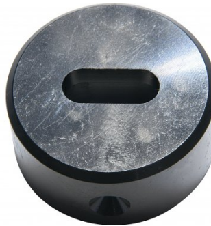
P6006 8.7 x 20.7mm Slotted Die