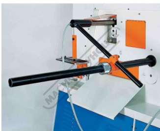
Includes Auto Touch & Cut Length Stop