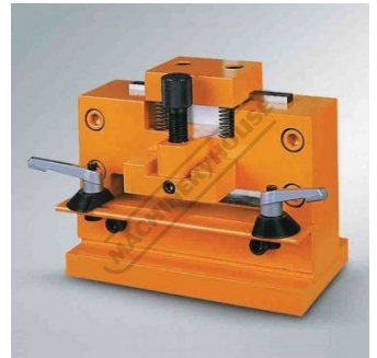
Optional Flat Bar Shearing