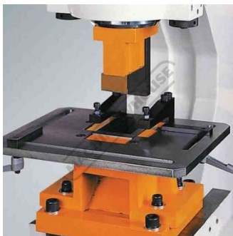
Optional Rectangular Notcher