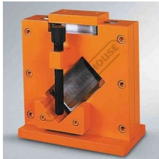
Optional Channel Shearing