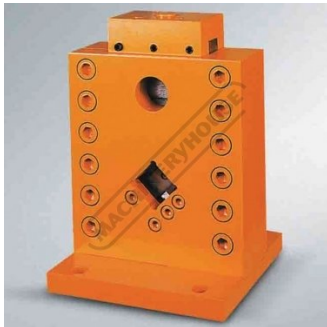
Optional Bar Shearing