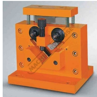
Optional Angle Shearing