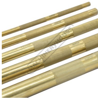
Textured Knurling for Enhanced Grip