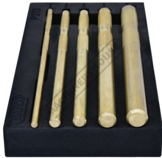
Foam Case End View