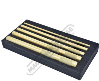
Set Shown in Foam Storage Holder