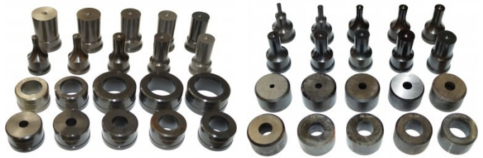
P165 Ø6-26mm Round Punch & Dies Set