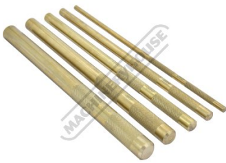
Top End View