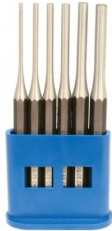
P365 Pin Punch Set - 6 Piece