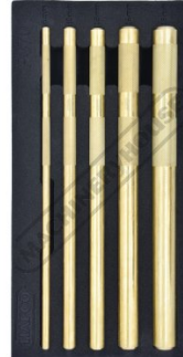
Foam Case Top View