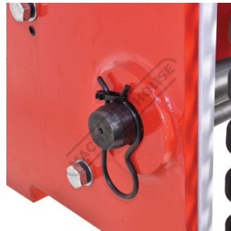
Pin Safety Clip