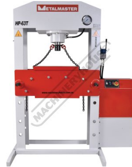
Table Height Adjustment Change