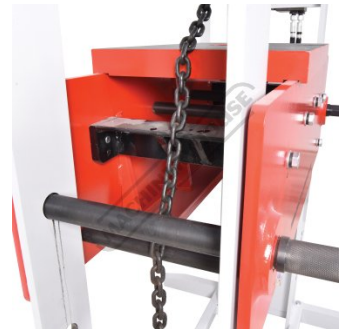
Table Height Adjustment Chain Slots