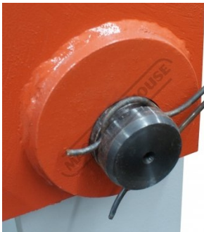
Pin Safety Clip