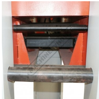
Table Chain Lifting Point