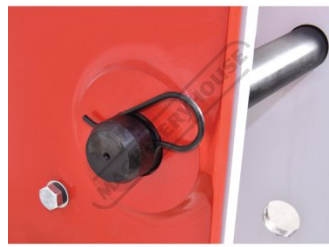
Pin Safety Clip