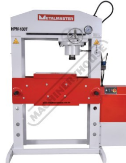
Ram moved to the right