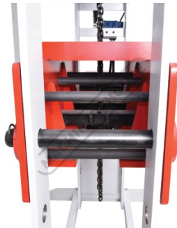
Table Height Adjustment Chain Slots