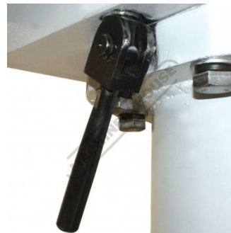
Head Locking Handle