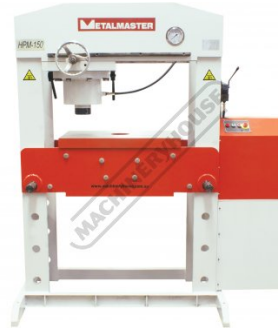
Front View Head Left Position