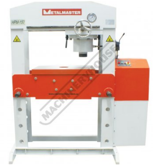
Front View Head Right Position