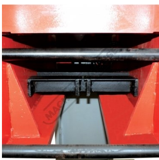
Table Height Lifting Points