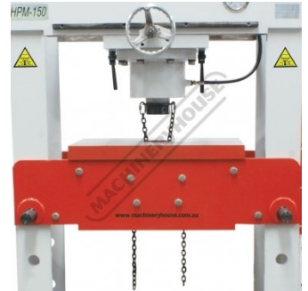
Table Height Adjustment Using Chain