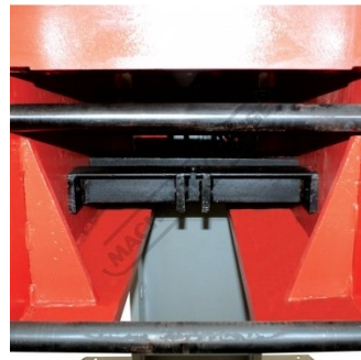
Table Height Lifting Points