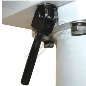
Head Locking Handle