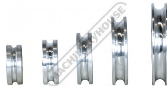
Round Formers Side View