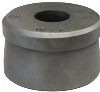
P738A Ø38.7mm Round Die - RDN2