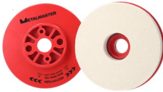
P7882 Felt Pad Polishing Disc 150mm