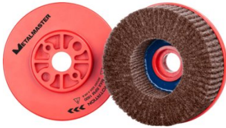
P7885 Non-Woven Abrasive Disc 150mm - Fine Brown