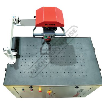
Top Table View