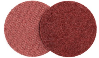
P7876 Non-Woven Abrasive Pad 150mm - Coarse Brown