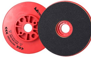
P7875 Backing Disc Hook & Loop 150mm