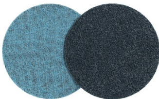
P7878 Non-Woven Abrasive Pad 150mm - Fine Blue