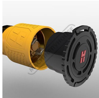
Shown with Optional Cartridge