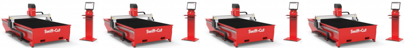
P9033 CNC Plasma Cutting Table