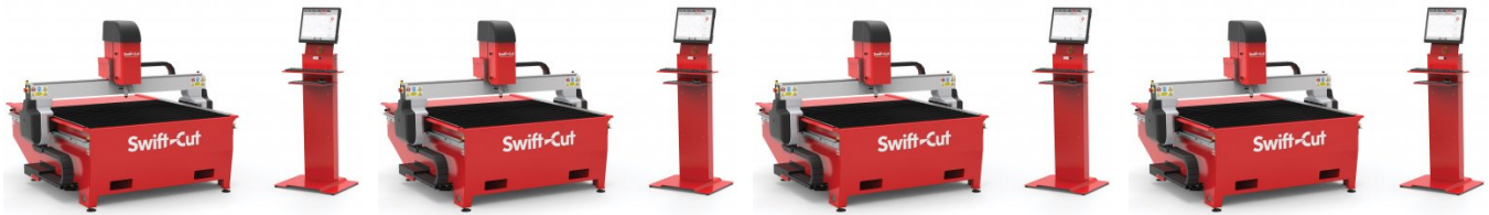
P9020 CNC Plasma Cutting Table