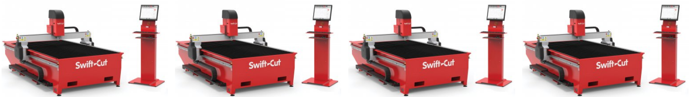
P9023 CNC Plasma Cutting Table