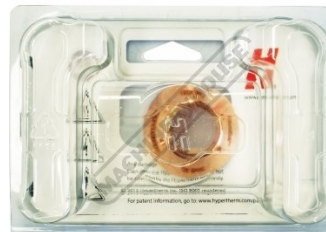
Packaging Rear View