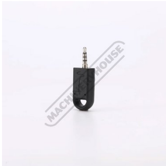
Marker Mode Dongle