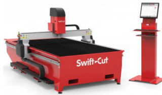
P9024 CNC Plasma Cutting Table