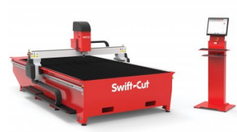
P9035 CNC Plasma Cutting Table