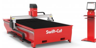
P9032 CNC Plasma Cutting Table