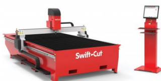
P9033 CNC Plasma Cutting Table