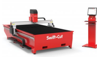
P9030 CNC Plasma Cutting Table