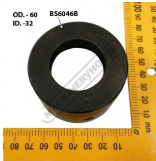
PP706 DIE BS6046B ADAPTOR 60 X 46mm