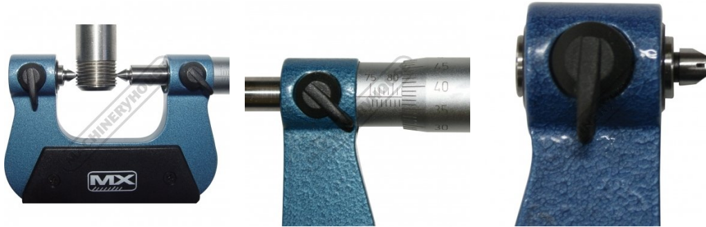
V shaped and cone shaped anvils