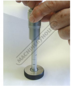
Shown with Setting Ring