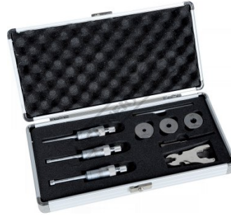
Foam Lined Aluminium Case