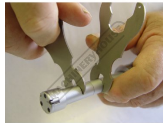
Spanners Shown In Use