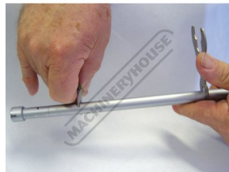
Shown Fitted with Extension Rod