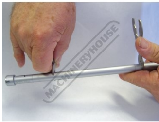
Shown Fitted with Extension Rod