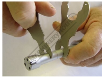
Spanners Shown In Use