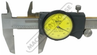
Head Close Up