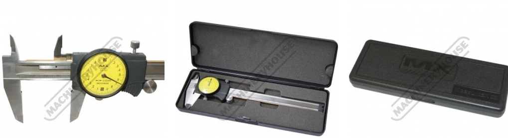
Head Close Up