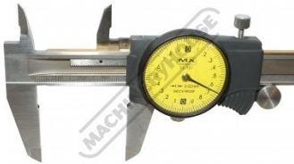
Head Close Up