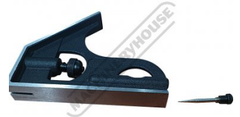
Includes Short Scriber