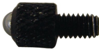
Q2167 Contact Point for Dial Indicators