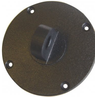
Q2125 Back Plate with Lug for Dial Indicators