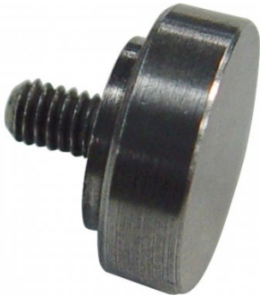
Q2167 Contact Point for Dial Indicators