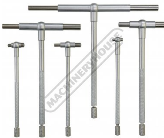
Metric & Imperial Comparator