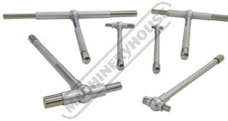
6 Piece Set