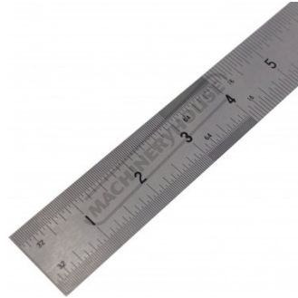
Imperial Close Up