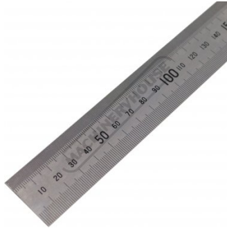
Metric Close Up