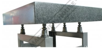
Adjustable Table Levelling Mounts