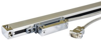
Q8540 1200mm Digital Readout Scale