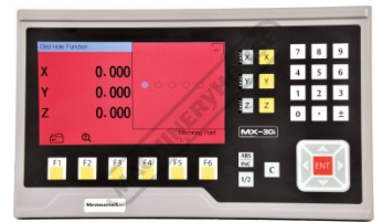
Grid Hole Function