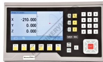
Simple Radius Function