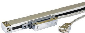
Q8526 420mm Digital Readout Scale