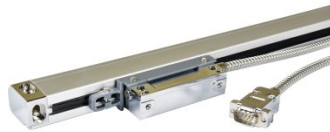
Q8543 1500mm Digital Readout Scale