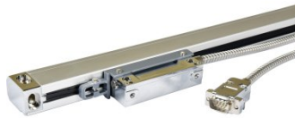
Q8548 2000mm Digital Readout Scale