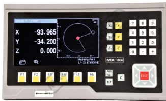
Smooth Radius Function