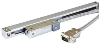
Q8512 220mm Digital Readout Scale