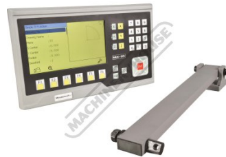
Mounting Arm Extension